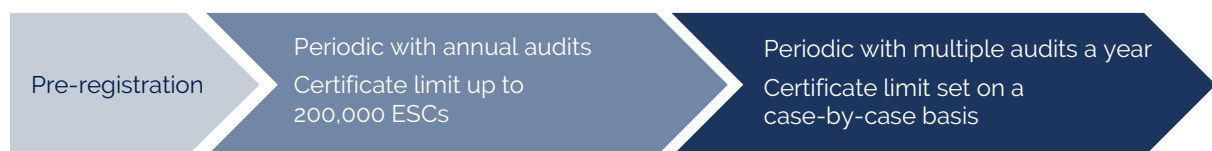
Figure 1 How conditions may change over time

New ACPs normally start with pre-registration audit conditions and change to periodic audit conditions with a certificate creation limit after completing an audit. The unaudited certificate creation limit may be amended over time. Figure 1 demonstrates this change for an ESS accreditation.